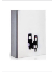
Hot Water Boiler