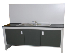
Counter Sink (Hot Water)