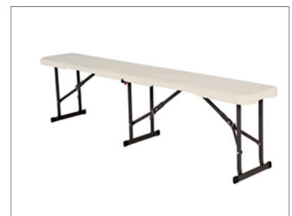
Bench Seat Bi Fold

Ask us about our furnished building kits to cover your project needs.