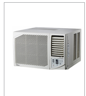
Reverse Cycle AC