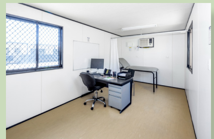
Furnished First Aid Room

To enhance your modular building experience, please contact your local Ausco representative for information about our 360° Solutions range of additional products and services.